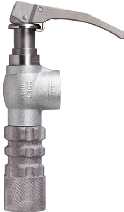
REGULAR MODEL A-QOVM-100 A-QOVM-125