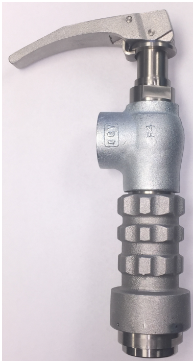
FAST FILL A-QOVM-125FF

Continental NH3 Products is proud to introduce our all new fast fill minimum bleed riser fill valve. We increased the outlet hole 75 percent, from 3/4" to 1" to match the inlet hole in the nurse tank valve. The minimum bleed feature allows the users to bleed the connection by loosening the coupling instead of using a bleeder valve. This is achieved by locating the seat down by the end of the coupling. This unique feature is very helpful on risers when filling nurse tanks. We use stainless steel for the bonnet, stems, poppet, and coupling nozzle for extended life. The knurled coupling on regular model helps users grip the coupling easier with gloves on and the large handle is great for small and large hands.